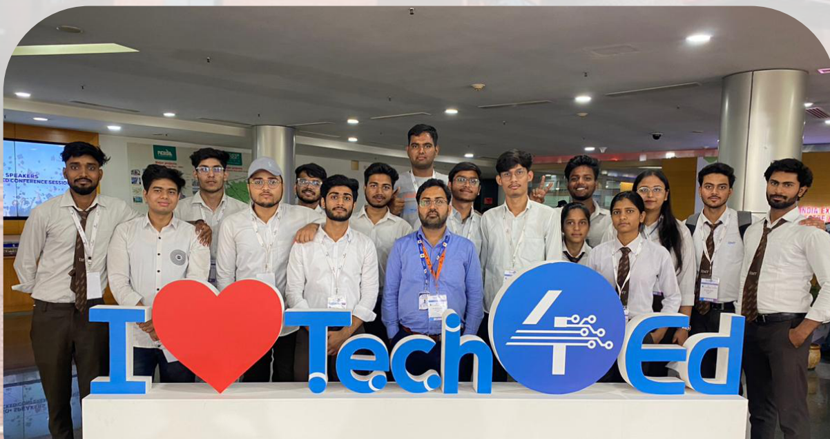
Students visit to Tech4Ed Expo

This was followed by a career counseling session conducted by the experts from different industries, which helped students to decide their career path. Post lunch, students visited the expo where various stalls were showcasing their technical courses and software products, currently in great demand.